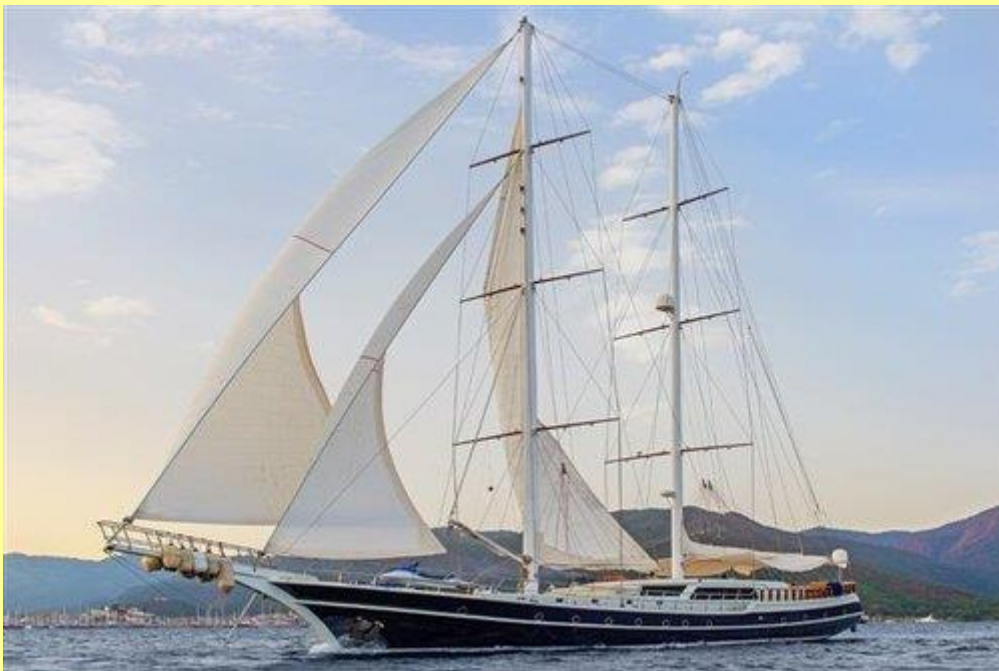
Perla Del Mar 2