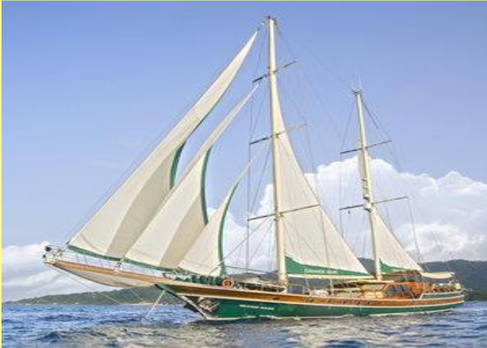
Grande Mare Gulet